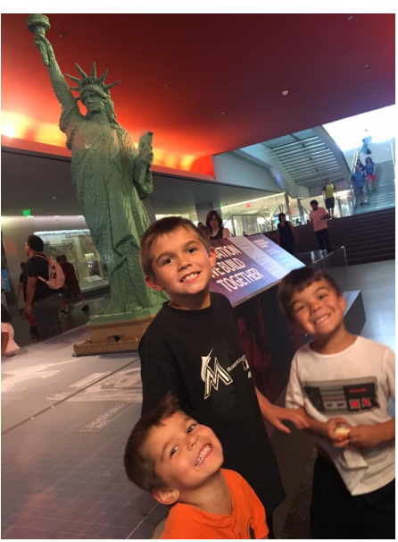
Smithsonian, with the LEGO Statue of Liberty. They LOVED these museums!