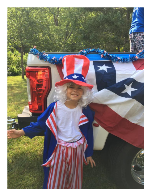
This guy loves history! At the 4th of July parade in Massachusetts.