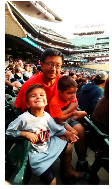
We got tickets to our first Twins game! The boys loved it!